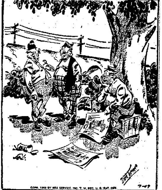
"He's worried about the future—he's afraid America is becoming a have-not nation!"