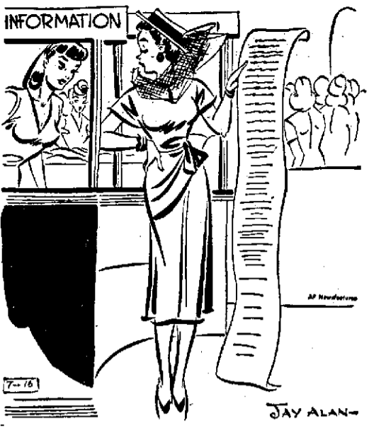
"I have a few little things here I'd like to ask you!"