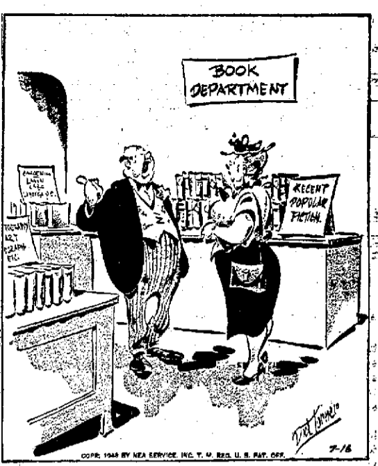
"You want 'Home Costs and the Housewife?' Yes, madam, you'll find the book down this aisle in the horror stories department!"