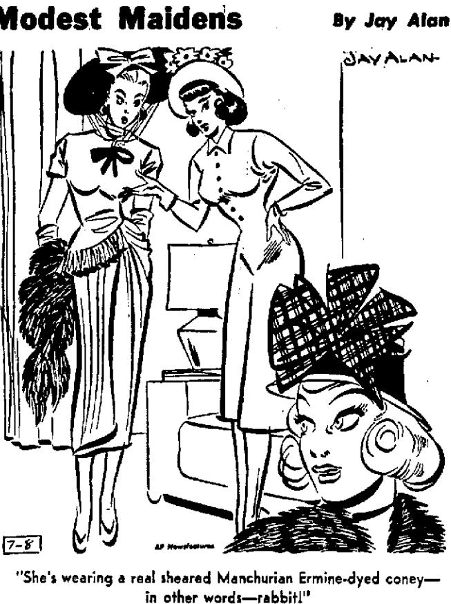
"She's wearing a real sheared Manchurian Ermine-dyed coney—in other words—rabbit!"