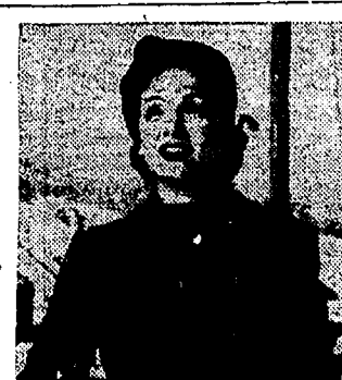
MARLENE DIETRICH WIBA at 7

* Started programs are also carried on corresponding FM stations... FM channels: WIBA-FM... 101.5 M. WHA-FM... 88.7 M. WVCB (WIBU)... 94.9 M.