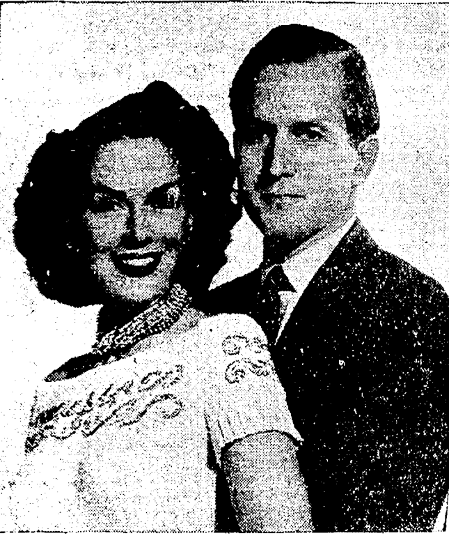
JINX FALKENBURG AND TEX MCRARY WIBA at 8