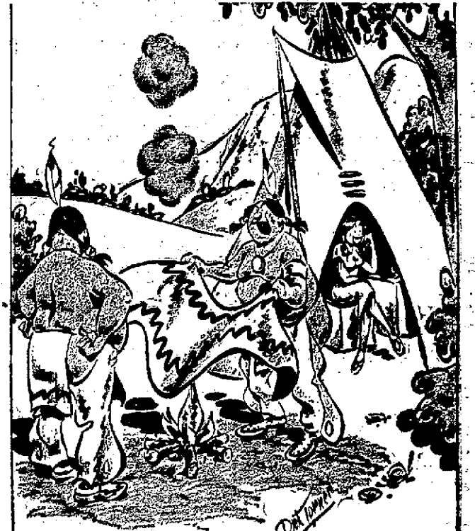
"Had-um phone installed for daughter—me never got to use-um fire!"