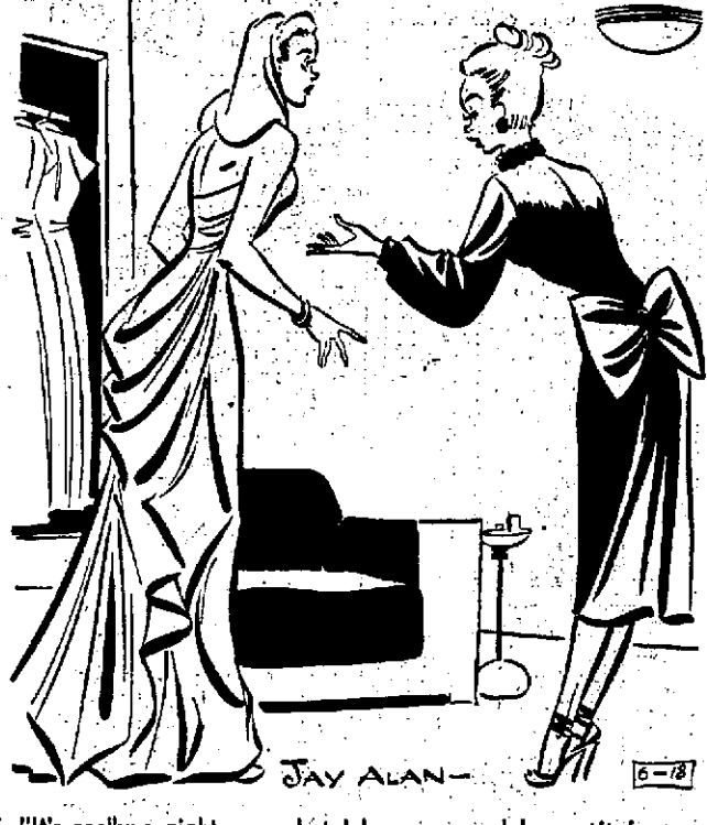
"It's really a night gown but I have one and I wear it for an evening dress."