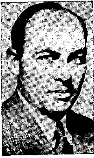
DR. GEORGE GALLUP WENR at 8:30

* Starred programs are also carried on corresponding FM stations... FM channels: WIBA-FM... 101.5 M. WHA-FM... 88.7 M. WYCF (WIBU)... 94.9 M.