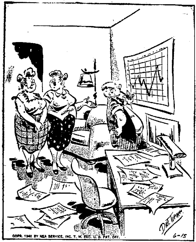
"Elmo's been trying for so long to find out how soon he can insult the landlord that he's become an expert on real estate trends!