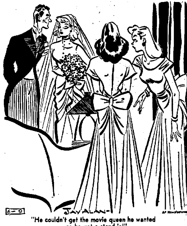
"He couldn't get the movie queen he wanted so he got a stand-in"