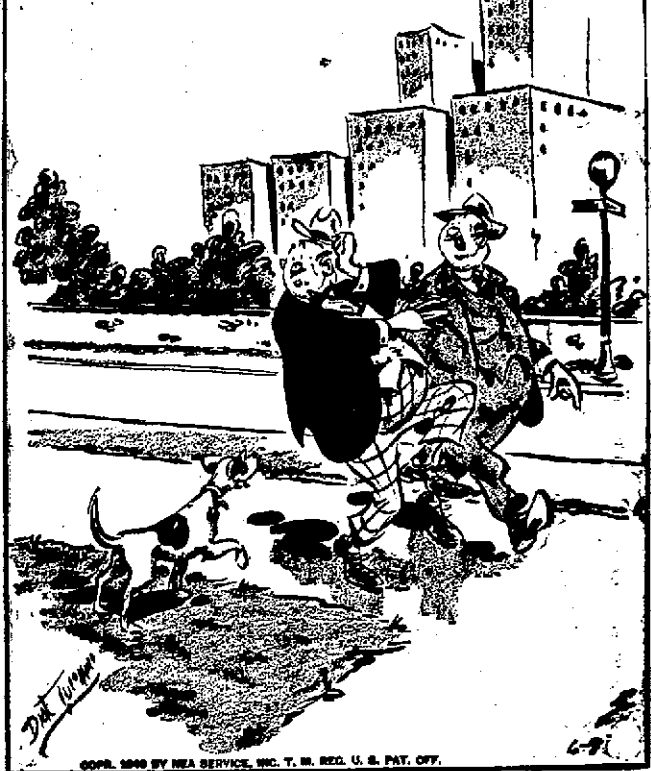
"That's our preacher's dog! He doesn't bite—just scares the devil out of you!"