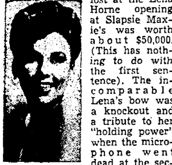
HORNE still they hardly breathed while she sang.

Don't be surprised if that much publicized deal for Joan Crawford to star in "The Ballad and the Source" for Walter Wanger suddenly falls apart. That diamond pin which Joan Crawford lost at the Lena Horne opening at Slapsie Maxie's was worth about $50,000. (This has nothing to do with the first sentence). The incomparable Lena's bow was a knockout and a tribute to her "holding power" when the microphone went dead at the second show, and people were so still they hardly breathed while she sang.