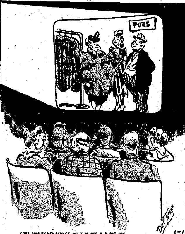
"Notice how he buys her a fur coat without insisting that she'll put him in the poorhouse!"