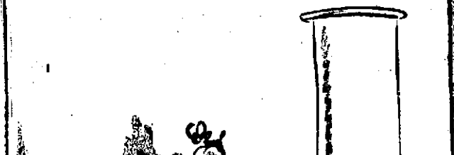
"That's one of our best sellers—'Handy Hints for Handling Hash.' It's been chosen mystery of the month!"