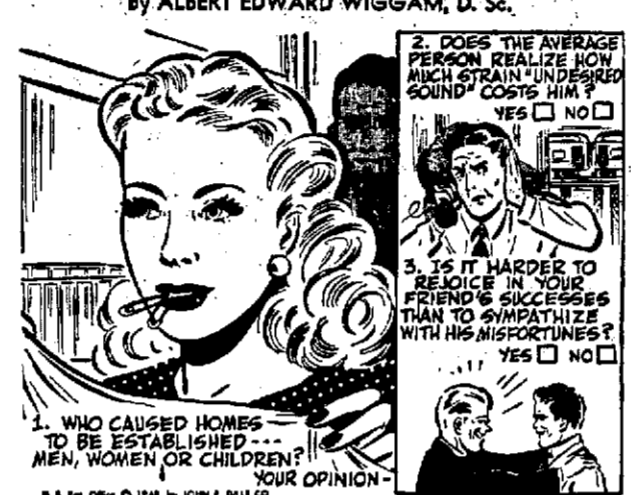
Answer to Question No. 1 Children. In prehistoric times men and women could and

THIS is the last of three articles giving you a glossary of the terms used in bridge. Revoke—To fail, when able to do so, to follow suit, or to lead or play as directed when paying a penalty.