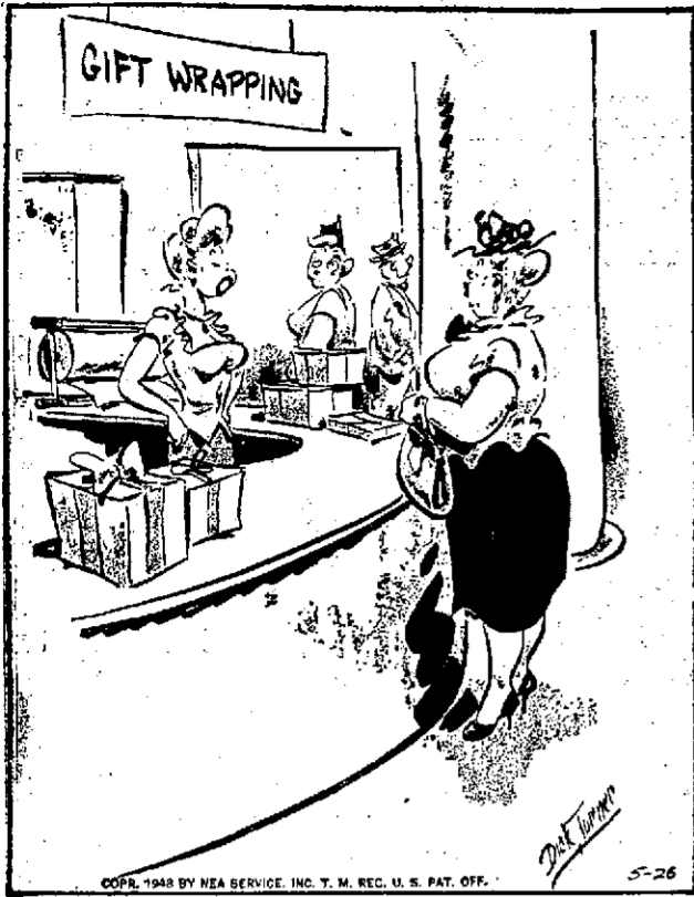
"On the de luxe 50-cent job, we enclose a card with instructions for exchanging!"