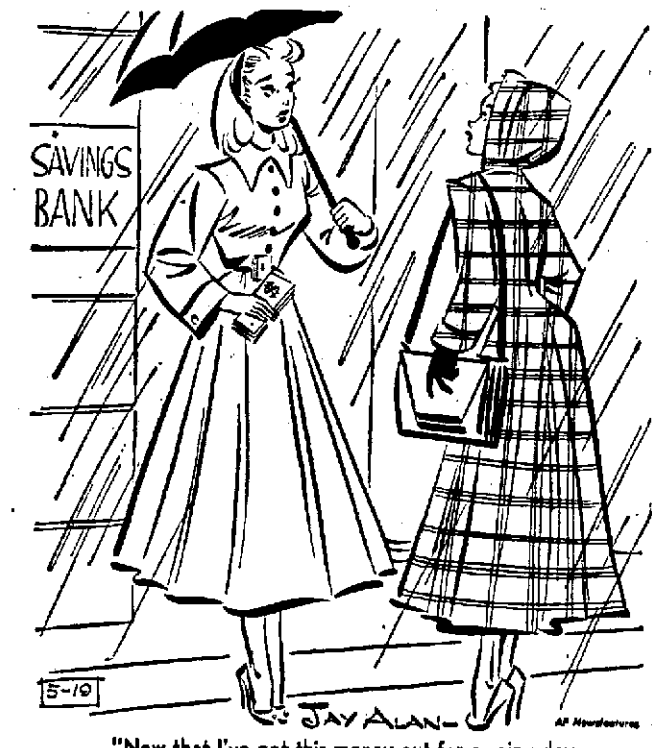
"Now that I've got this money out for a rainy day I don't know what to do with it!"