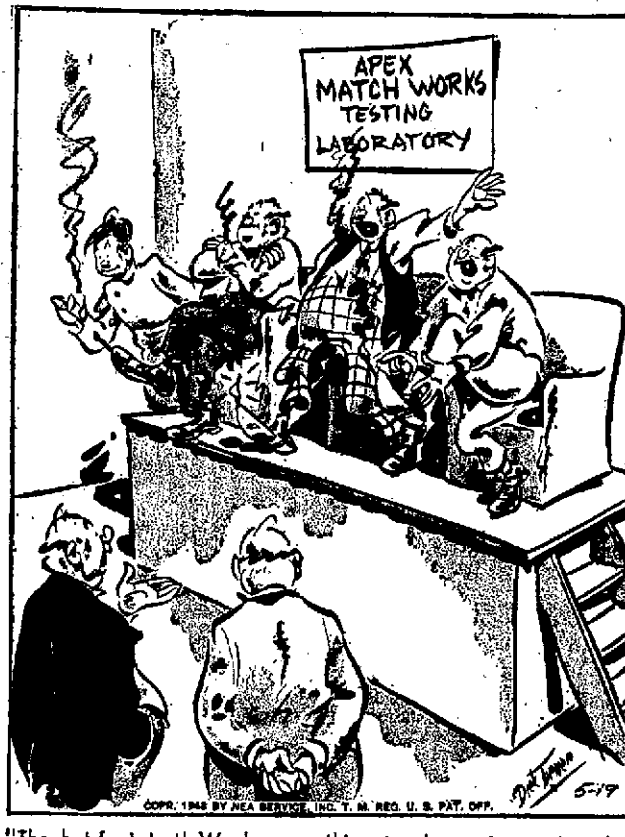
"The hot-foot test! We leave nothing to chance in proving that ours is the finest product on the market!"