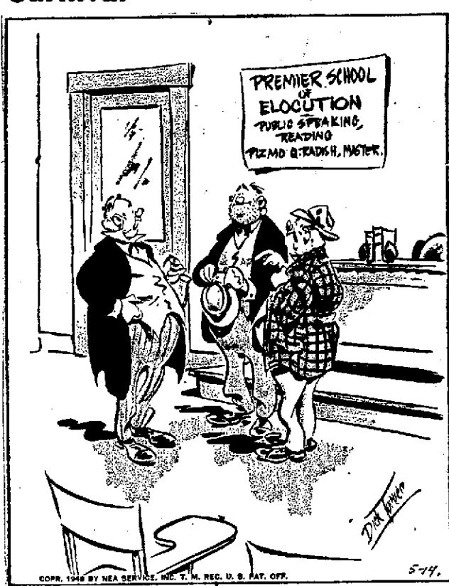
"The Strangler here has got an important bout coming up and I figured you could help him—he don't groan right!"