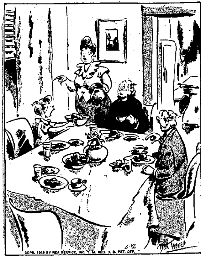
"Go on! Have some more, Reverend—Mom figured you for a second helping!"