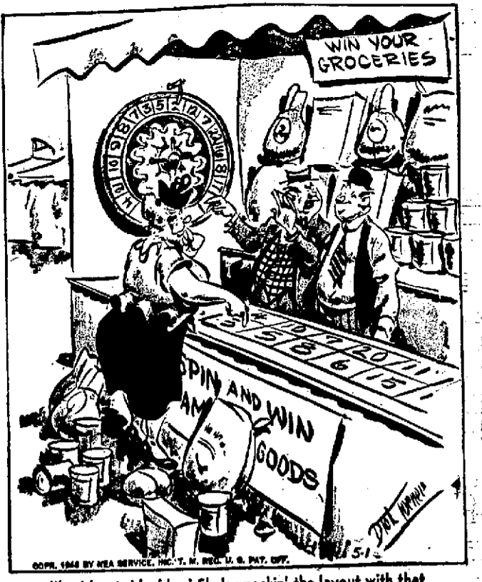
"I said get rid of her! She's wreckin' the layout with that senie-menie-minee-no system of hers!"