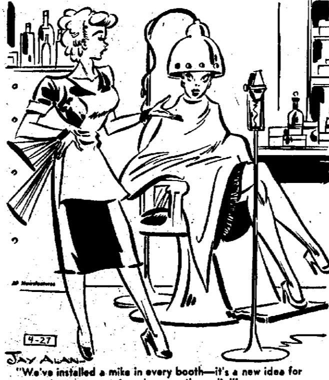
"We've installed a mike in every booth—it's a new idea for a gossip column on the radio!"

Tournament—Neither vul. South West North East Pass 1 Pass 3 Pass 3 Pass 4 Pass 4 Pass 4 Pass 6 Opening—♦K 27