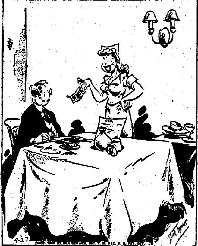
"If I'd known you were so nice, I'd never have let you eat that hamburger!"