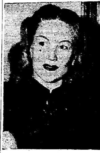
DOROTHY KIRSTEN WIBA at 8

Although Gregory Peck is up and about with that healing broken leg of his, he can navigate only on crutches. Not permitted even to ride in a car for fear the vibration might delay the mending of the fracture.