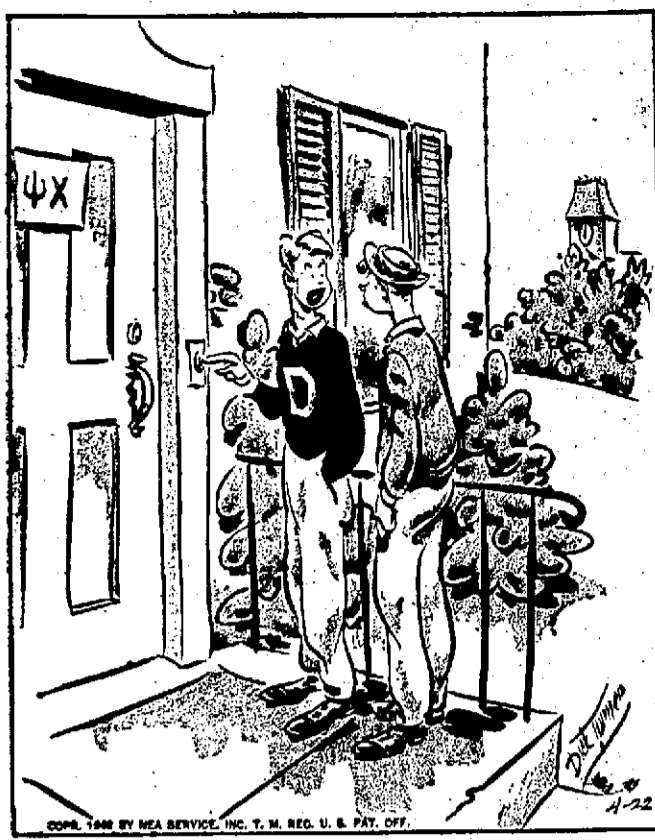
"If we call for the girls now, we can rush over to the dorm and dress before they come down!"