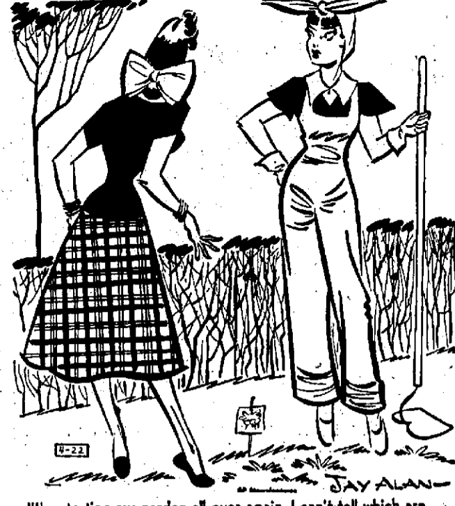
"I'm starting my garden all over again. I can't tell which are weeds and which are vegetables!"