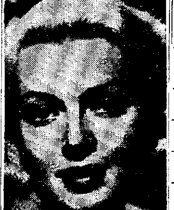
LANA TURNER WIBA at 9

SYKES RUPTURE SYSTEM 36 S. STATE ST. CHICAGO 3, HL.