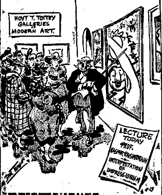
"Notice the Chinese characters enter the picture as the artist's mood develops—he probably remembers he has to pick up his laundry!"