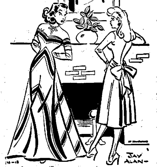
"I don't dislike him, but I like new things. I get tired of looking at the same old husband all the time."