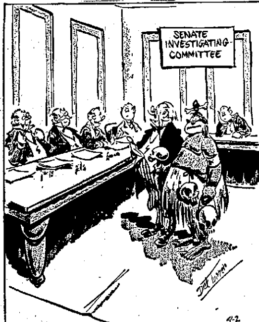
"And here is a gentleman I have asked to give expert testimony on the dangers of runaway meat prices!"

Italy has 99 political parties on its hands, and nobody knows who trouble this adds up to, unless it's the chairman of our Democratic national committee, at this time.