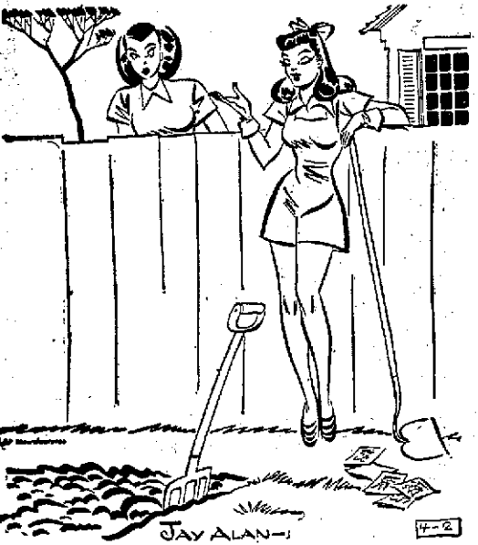
"See whiz! This ground can't be any good, it's spoiled and all full of worms!"

Italy has 99 political parties on its hands, and nobody knows who trouble this adds up to, unless it's the chairman of our Democratic national committee, at this time.