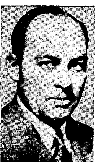
DR. GEORGE GALLUP WIBA at 930