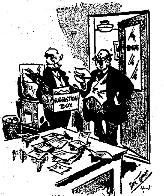
"What kind of a suggestion is this—'Twinkletons Murphy, Main 5-2709'?"