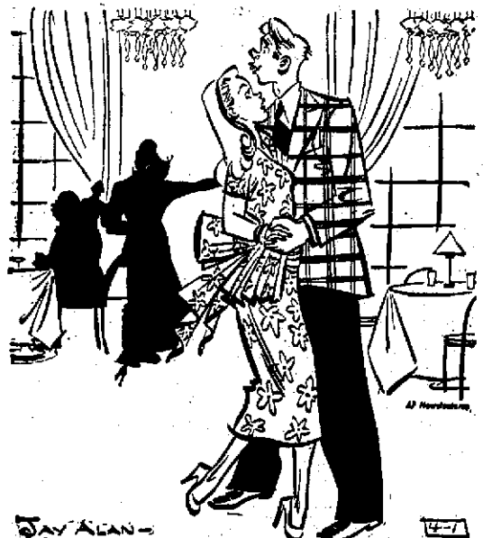
"Look, Elmer, don't pout! Don't I always give you a date on April Fools' day?"