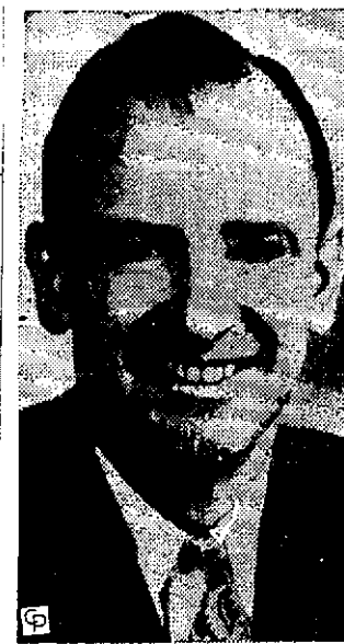
SEN. JOSEPH MCCARTHY WENR at 7:30