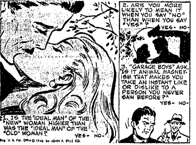
Reg. U. S. Pat. Office 1948. By JOHN F. DILL CO.