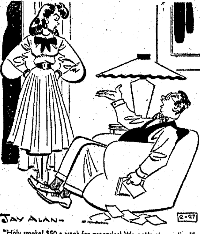
"Holy smokes! $50 a week for groceries! We gotta stop eating!"