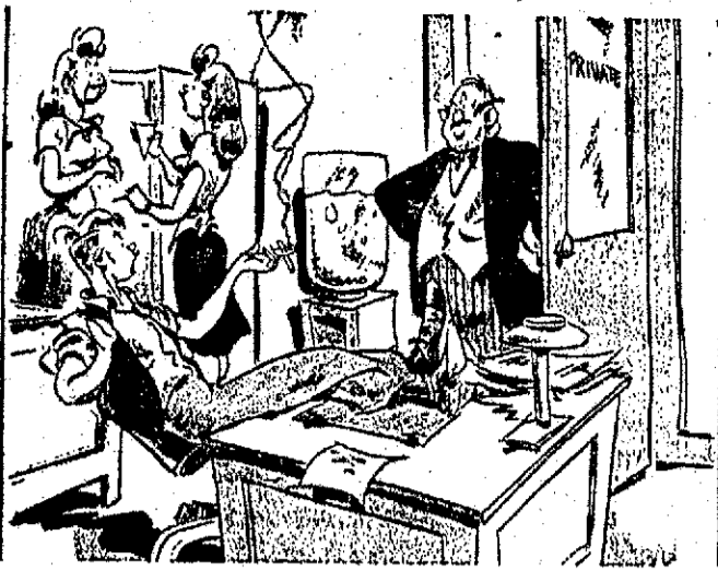
"You find a clause in our union contract that entitles us to your vacation whether you take it or not!"