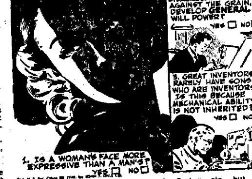
IS A WOMAN'S FACE MORE EXPRESSIVE THAN A MAN'S?

Booth, Irving, etc., but it is doubtful that any have ever risen to the heights of Duse, Rachel, Siddons, Bernhardt and many others. Men have much more of a "poker face" than women.