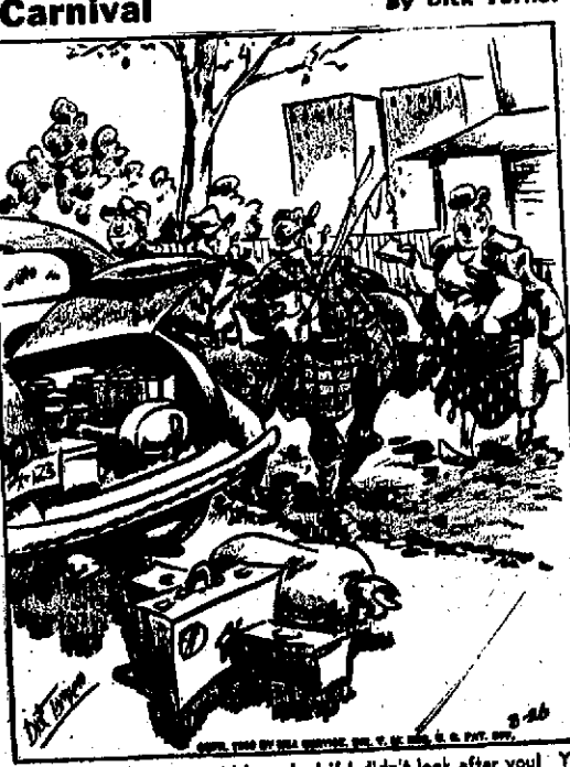
"A fine fishing trip you'd have had if I didn't look after you! You forgot the cards, chips and your bottle of Old Swirl!"

Q. Is there any limit on the amount of F and G bonds that an individual may purchase?—T. R. N. A. One individual may purchase $100,000 of either F or G bonds or of both. He cannot purchase $100,000 of each in any one year.