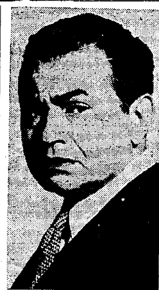
EDWARD G. ROBINSON WIBA at 8

At all drug stores everywhere—in Madison, Walgreen's and Rensselaer Drug.