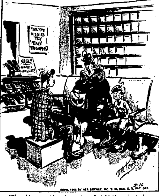
"Show him something nice and comfortable for school-he

H. B. A When the female eel becomes mature her color changes, and, following an irresistible urge to go down to the sea, she heads downstream on the long journey to the Sargasso Sca. Here, she lays about 10,000,000 eggs and when these are fertilized she and her mate die.