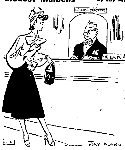
"Mr. Burp? Oh, they found he was putting your money away for a rainy day!