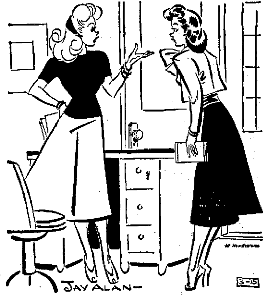
"I don't know which one to marry! One has a good head but no hair, the other has hair, but no head!"