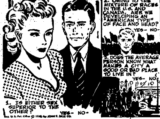
1. IS EITHER SEX SUPERIOR TO THE OTHER? YES-NO