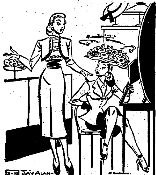
"But, Madame, it's spring, you know, birds and flowers—and bees!"