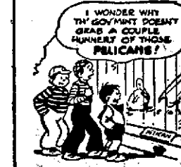
I WONDER WHY TH' GOV'N'T DOESN'T GRANT A COUPLE HUNNERTS OF THOSE PELICANS!