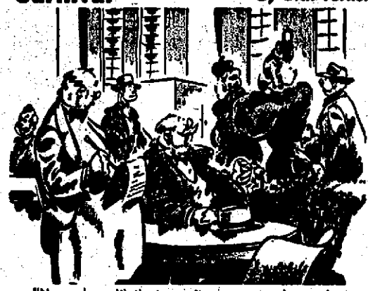
"No crackers with the tea, waiter—one never knows when one will want to whistle!"