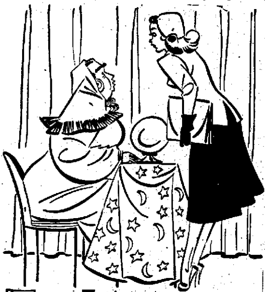
"It's not my fault I can't see a boy friend in your future—there's a heavy fog over Manhattan!"