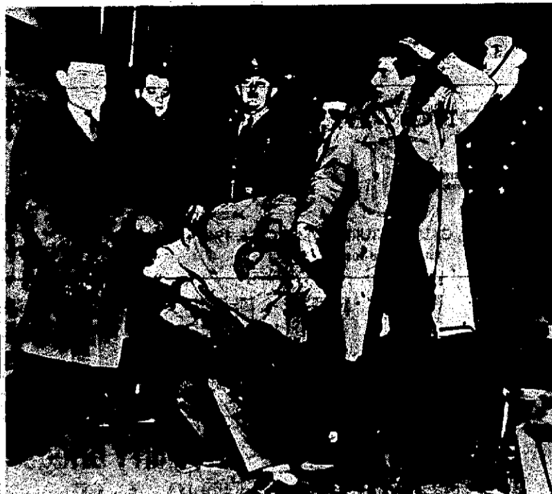
CAPTURED BY POLICE—The two handcuffed men shown here were captured today by a small army of police officers after a Pittsburgh gun battle in which two radio patrolmen were shot.

SACRAMENTO, March 6. (AP) Harold Stassen, Republican Presidential aspirant from Minnesota, has not indicated whether he will enter the California primaries.