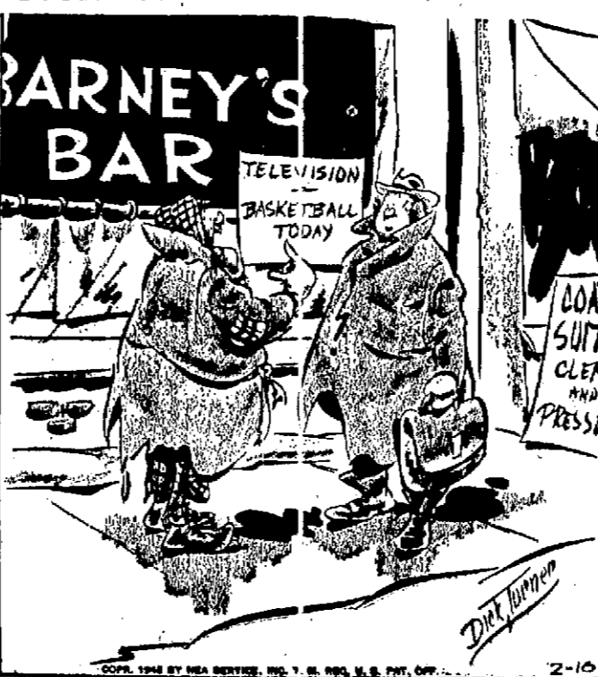
"Spare a quarter for a couple beers, guv'nor, so a loyal fan can see the home team win a game?"