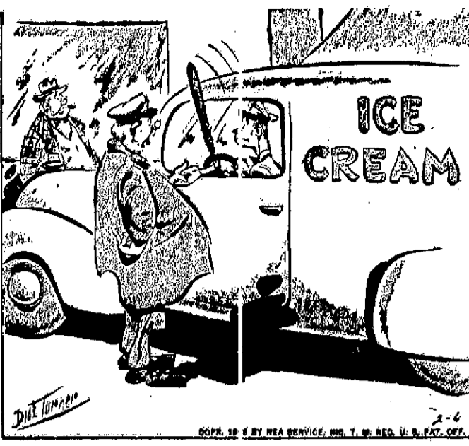
"Hi-m-m-l. Passing a reel light and all sold out!"

A reader asks... Q. Approximately how much of the 24 hours should a household electric refrigerator run? A. Specialists of the Department of Agriculture say that electric refrigerators made in recent years rarely run more than one-third of the time when set at normal temperatures under ordinary kitchen conditions.