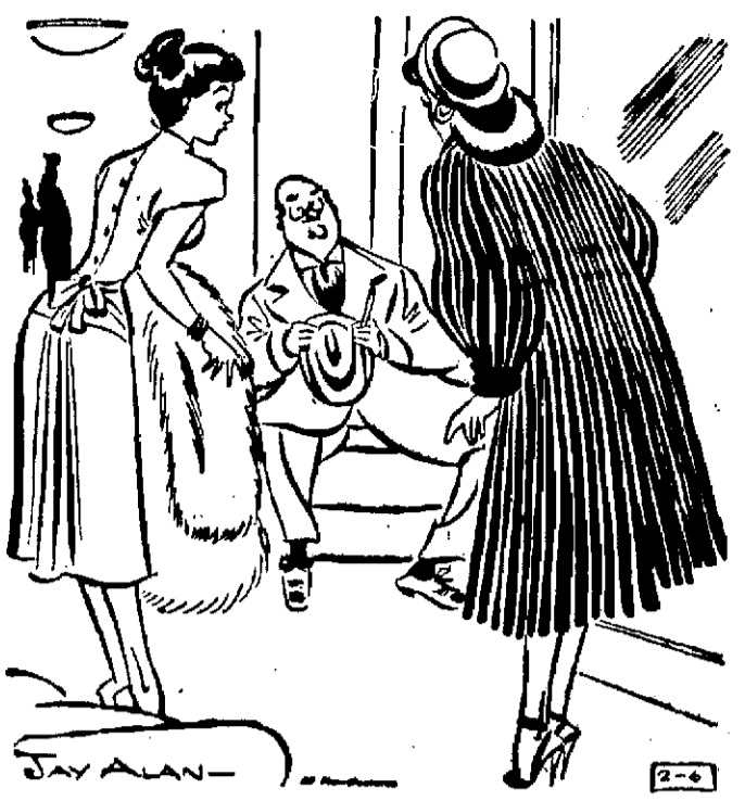
"Unfortunately, darling, mink is the only thing I look good in!"