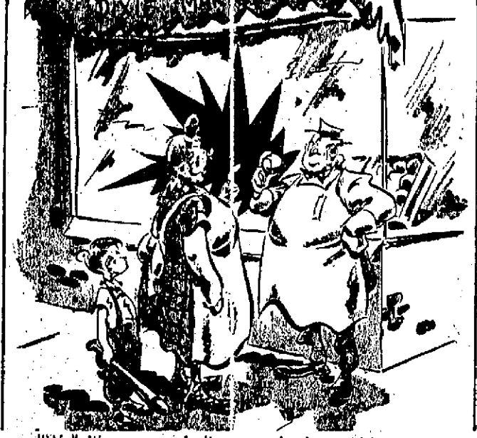
"Well, it's your own fault—every day it was 'Got a nice ball and bat for a dozen boxtops, Mrs. Finnegan!'"

Q. What American city has a celebration on Groundhog Day? H. I. G.