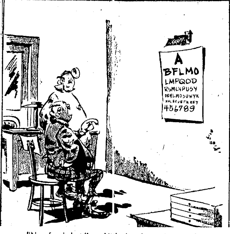
"Now for de last line—Litte Joe, fever, six, natural, eightier-from-Decatur, Ninal"

A. It may be six years. Some very rare orchids have taken 16 years to bloom.