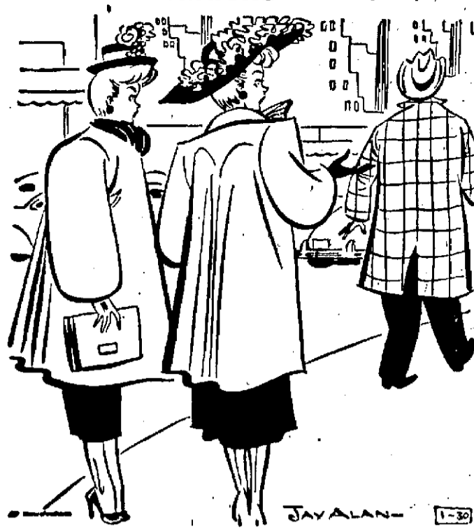
"He's very quick with a dollar—he runs up and puts it right in the bank!"