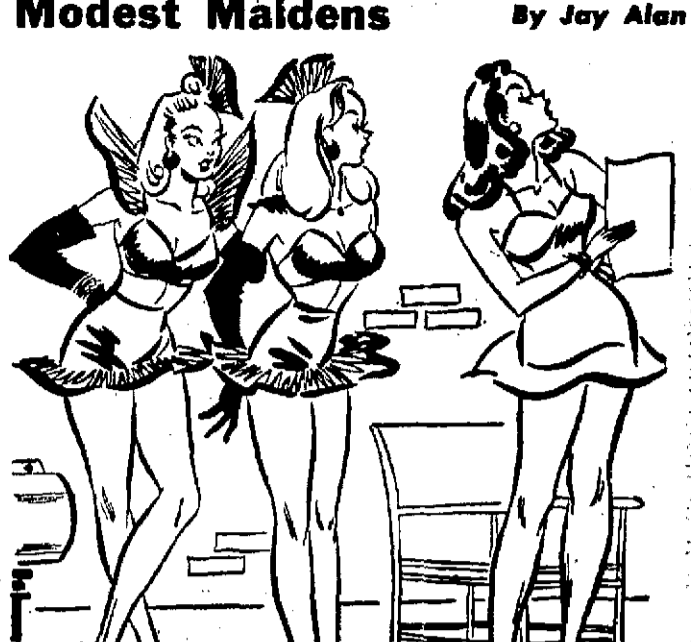
"So she's a singer, huh? I'll bet she's in a sax-tet!"