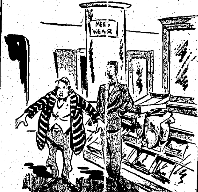
"It's the very latest in lounging coats, conveying a definite hint when one's wife won't let one out at night!"