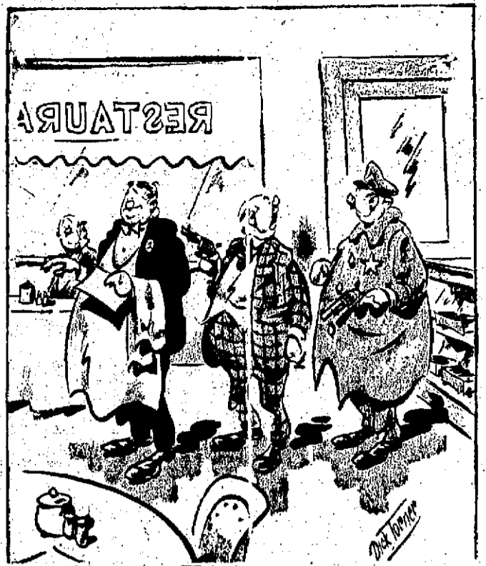
"Whetsa matter? Can't a hungry customer get his order taken around here without the police barging in?"