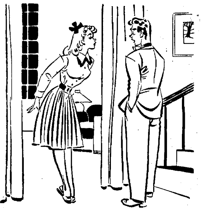
"I don't care if it is leap year, I can't marry you on my salary!"