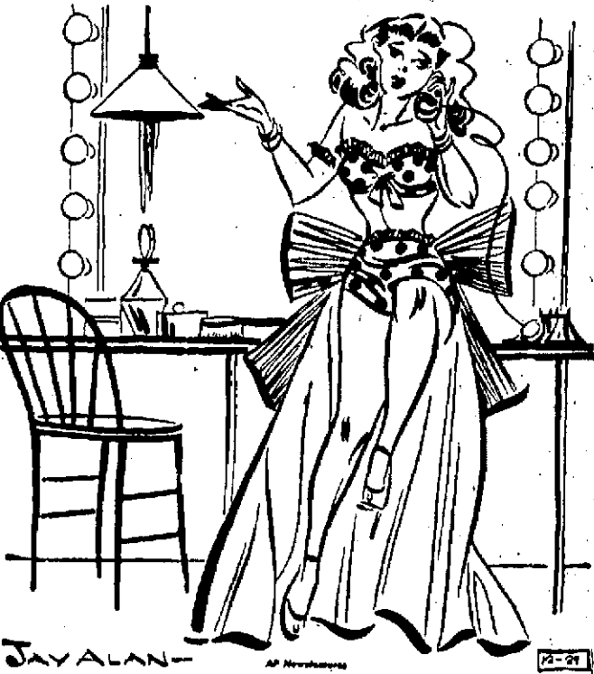
"I have a new boy friend with 5,998,000 dollars and no nose!"