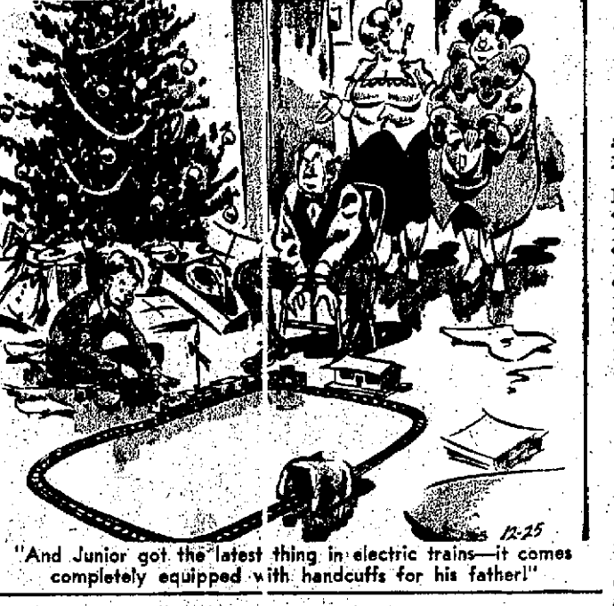
"And Junior got the latest thing in electric trains—it comes completely equipped with handcuffs for his father!"