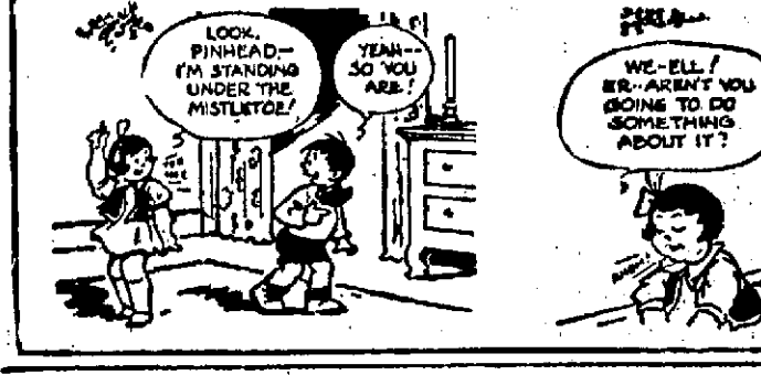
LOOK, PINHEAD—I'M STANDING UNDER THE MISTLETOE!