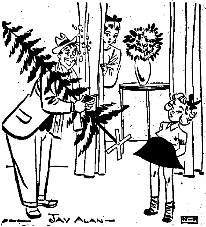
"Mal Pop's got the tree, but he's the one that's lit up!"