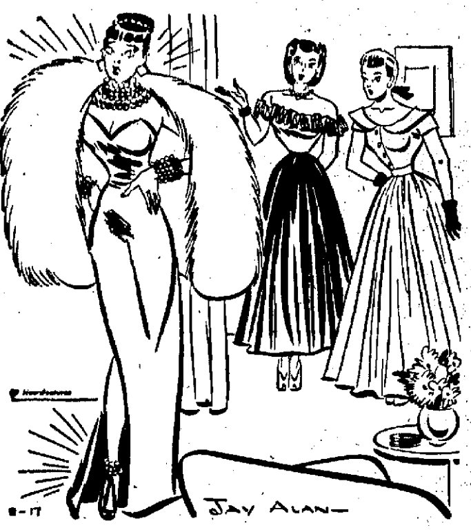
"She's a card all right—the Queen of Diamonds."