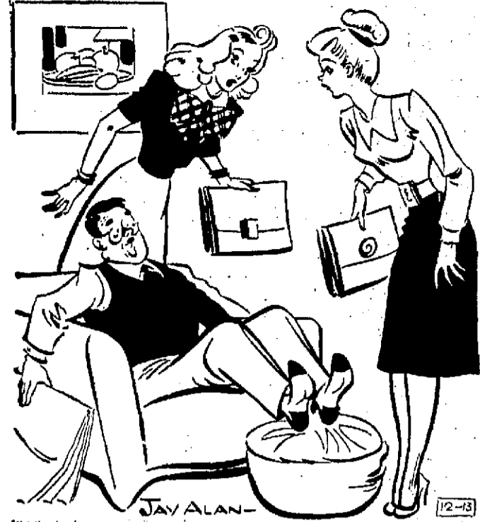
"What do you want for Xmas, dad, and give us some money to buy it."