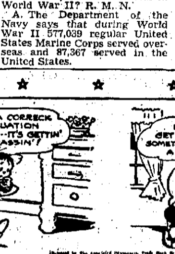
"Another thing—we don't believe in loading you down with a lot of accessories!"