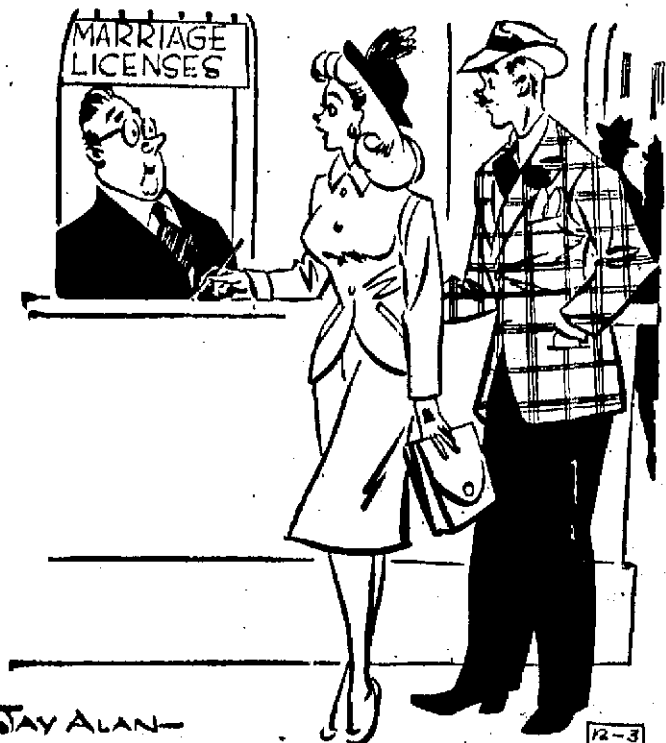
"We both have ulcers so we thought we'd make a wonderful couple!"