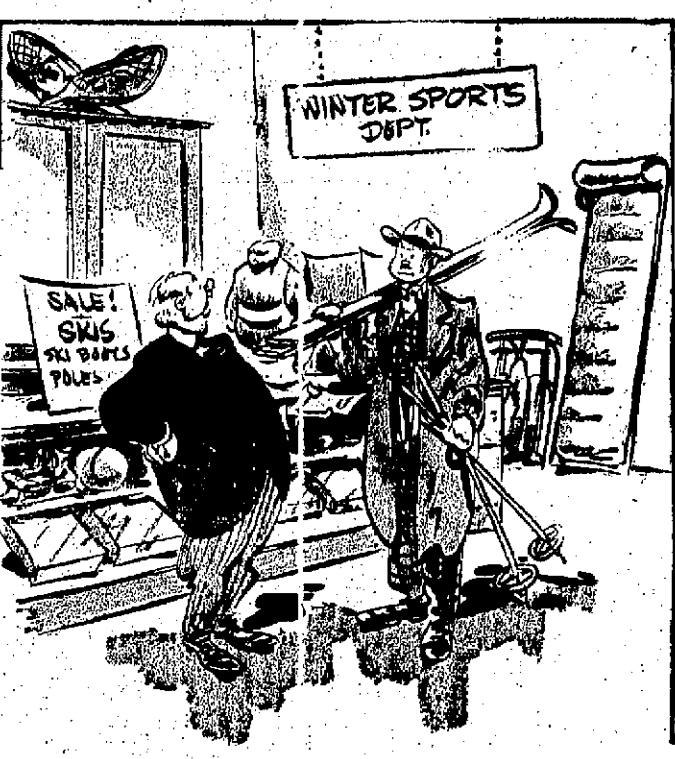
"This little pamphlet goes with them—it tells how to convert them into a pair of splints!"