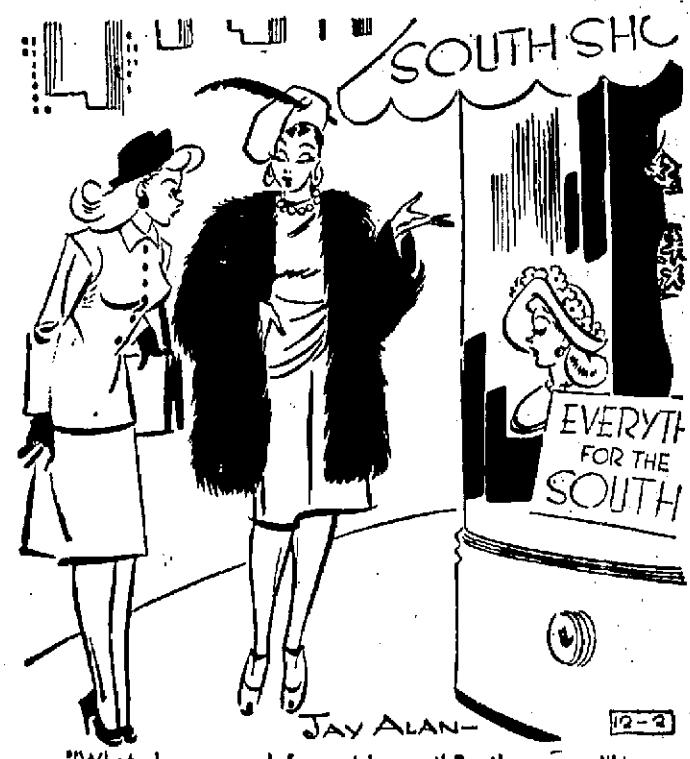
"What do we need for a trip south?—the money!"