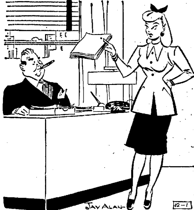
"We'd better keep these records secret if we don't want Petrillo to ban them!"